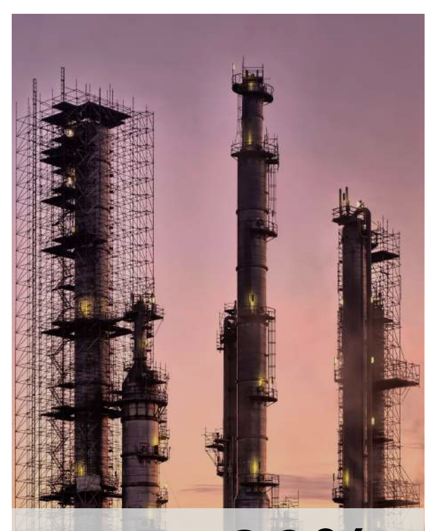
Oil price - 20% drop in a single day

across all countries and sectors. Hence, we opine that that the drastic price drop on bonds were mainly due to lack of liquidity, as fund managers, investors and ETF funds all rushed for the exit door at the same time.