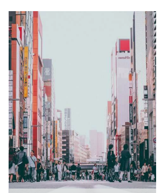
COVID-19 spread outside of China

During this steep sell-off, we have seen investment grade bonds sold off by 5 to 10 points and noninvestment grade bonds marked down by up to 30-40%. The mark down of prices was indiscriminate